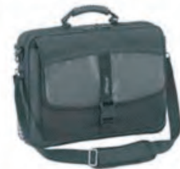
Ground Test and Maintenance Products