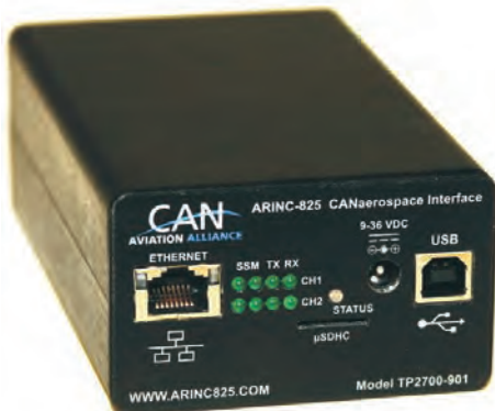
Data Bus Interfaces