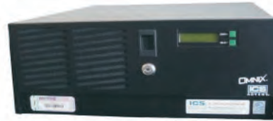
Industrial Computing Platforms