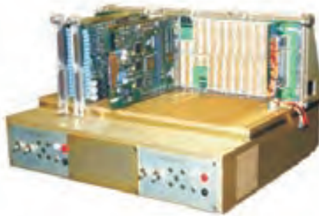
Production Test Fixtures