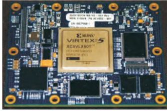
HW / SW Design to DO254, DO178