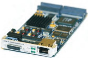
Design and FAB of Engineering Development Tools