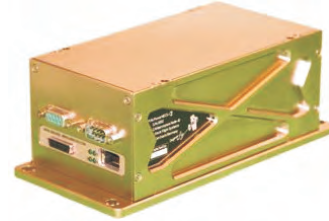
Custom Flight Test Acquisition