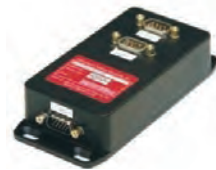
Design and Production of Avionics